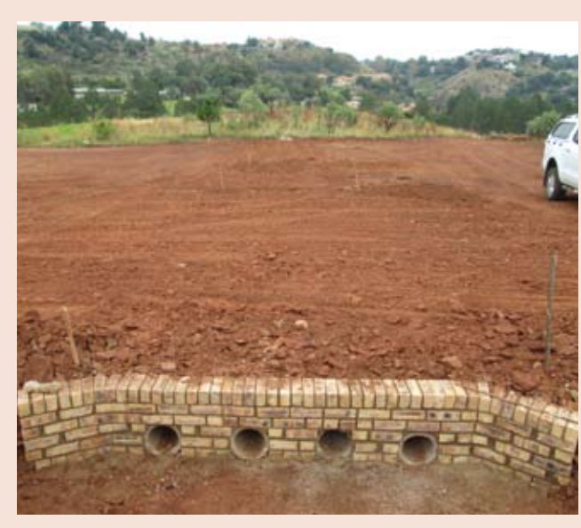
The "scorpion tunnel" at Ponders End